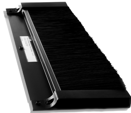
6 inch/152 mm filaments Item No. 10013