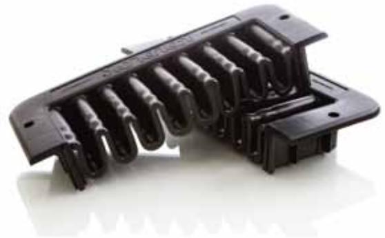
Item Nº 20100