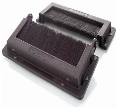
Item No. 2020