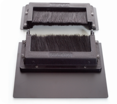
Item No. 2030